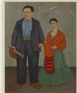
Diego Rivera and Frida Kahlo