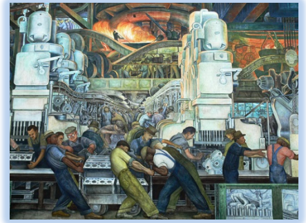
One Diego Rivera Mural that is On Permanent Display at the Detroit Institute of Arts