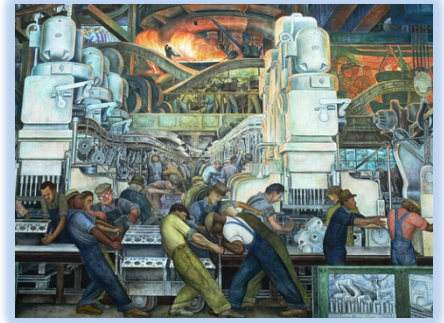
One Diego Rivera Mural that is On Permanent Display at the Detroit Institute of Arts