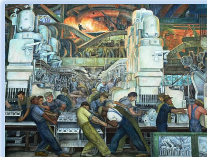
One Diego Rivera Mural that is On Permanent Display at the Detroit Institute of Arts