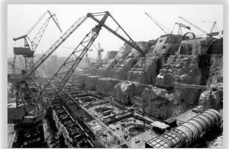
Construction Site of Three Gorges Dam