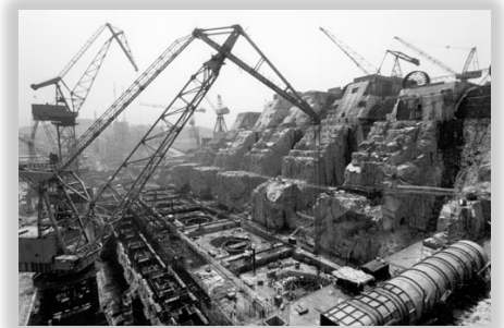
Construction Site of Three Gorges Dam