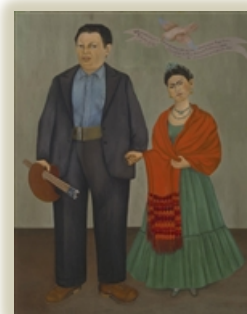
Diego Rivera and Frida Kahlo