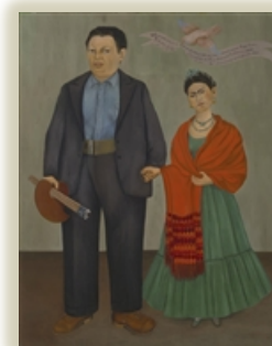
Diego Rivera and Frida Kahlo